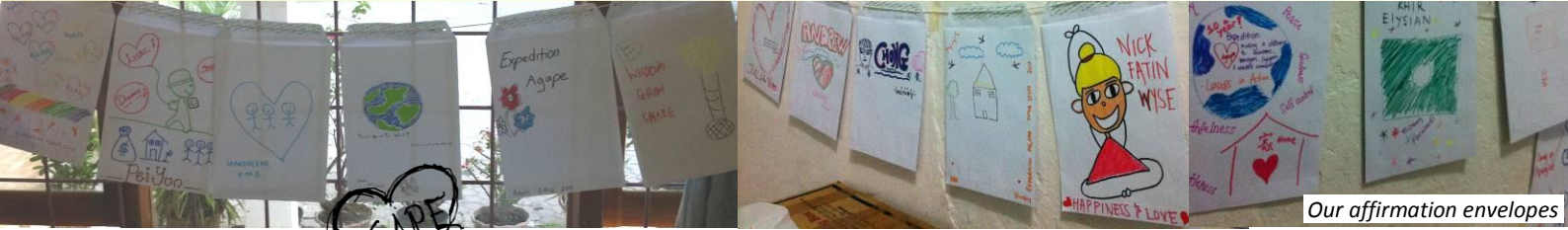
Our affirmation envelopes