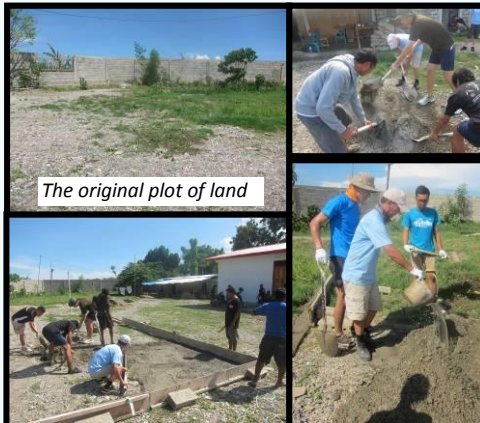
The original plot of land

used for many outdoor sports and educational activities/ programmes.