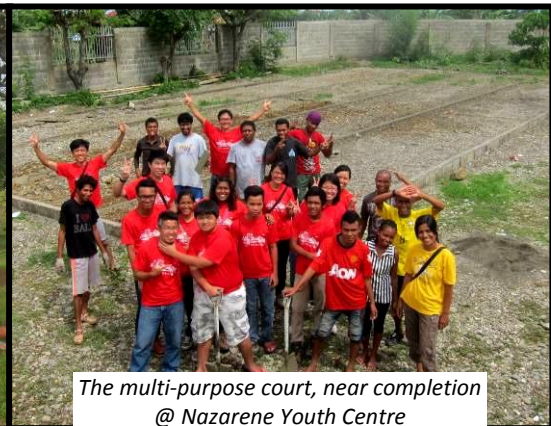
The multi-purpose court, near completion @ Nazarene Youth Centre