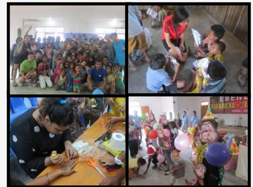
Education, learning and exchange

We conducted many meaningful workshops and activities for the children at the Youth Centre too, and brought joy, smiles and enriched learning and cultural exchange to the community, through arts and crafts, song and dance, as well as games and fun. We also organised a Singapore Day , carnival-style, to share about our local traditional games, food, costumes and culture and a closing Christmas Party which was a time of laughter and celebration and marked an important gathering and festival for the Timorese.