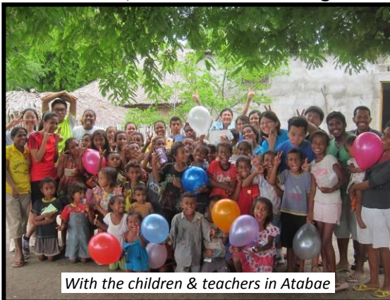
With the children & teachers in Atabae